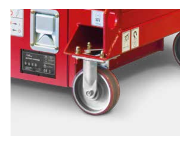
Non-marking solid tyres