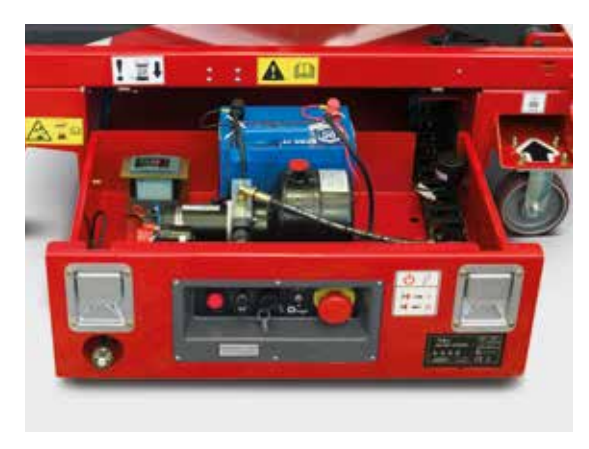
Slide or pull-out engine trays